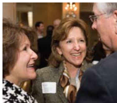
U.S. Senator-Elect Kay Hagan (center)