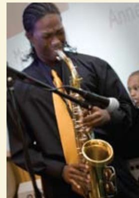
Triad Youth Jazz Society performed.

Nearly 450 people helped The Community Foundation celebrate its Silver Anniversary at its Annual Luncheon on Nov. 10 at The Empire Room in Greensboro.