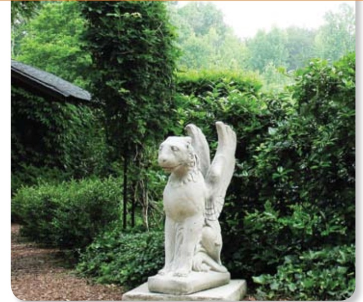
Royal Griffins greet all who enter Cove Creek Gardens.