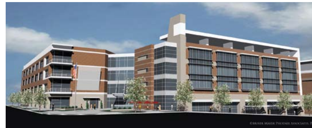
An artist's rendering shows how the proposed South Elm/Lee Street redevelopment project might look.

A major proposal to redevelop a portion of southeast Greensboro—a concept that calls for an unprecedented partnership between the Greensboro City Council, the Guilford County Board of Commissioners and Guilford County Schools—has been unveiled for consideration by a new subsidiary of The Community Foundation.